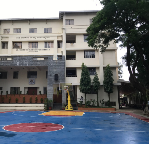
Before - LOYOLA HALL - Now